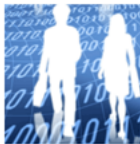
Access SIPP Data

More information about this survey, and accessing the data can be found on the Census SIPP web page .