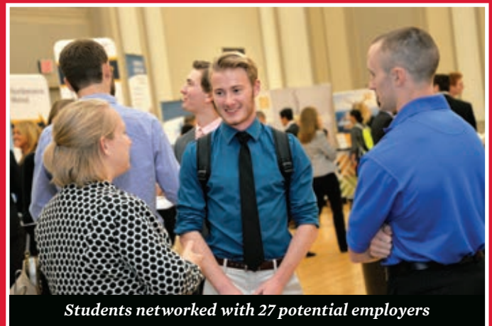
Students networked with 27 potential employers