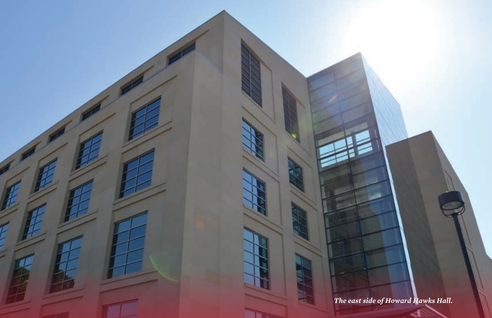
The east side of Howard Hawks Hall.