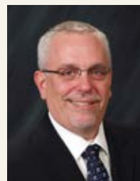
Clark Sackschewsky Tax - DBO USA, LLP