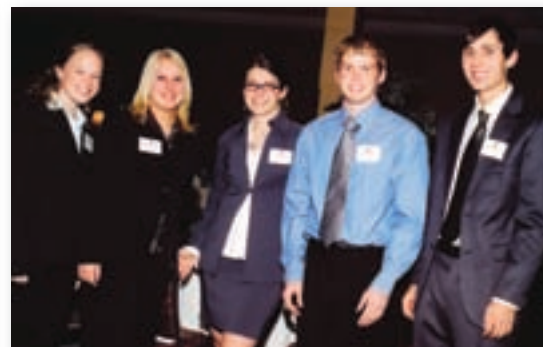
Beta Alpha Psi students