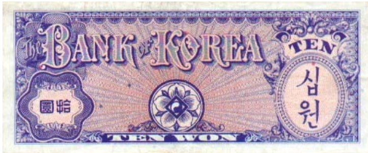
South Korean Won