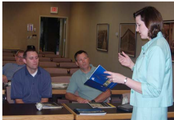
Participating teachers visit the Federal Reserve Bank-Omaha Branch for a luncheon workshop as part of Econ 850, Part 2.

http://cehs.unl.edu/tlte/graduate/masters.shtml